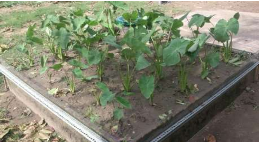
Taro planting underground irrigation 42 days