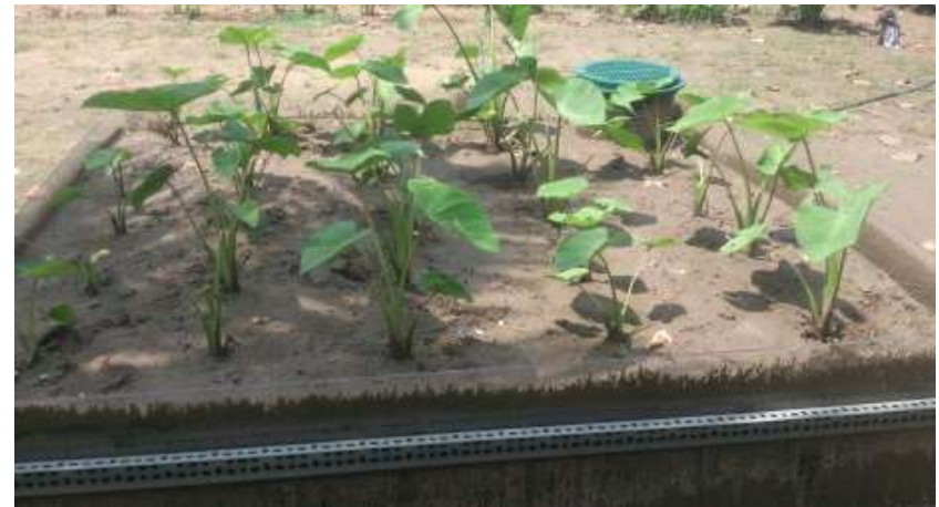
Taro planting underground irrigation 30 days