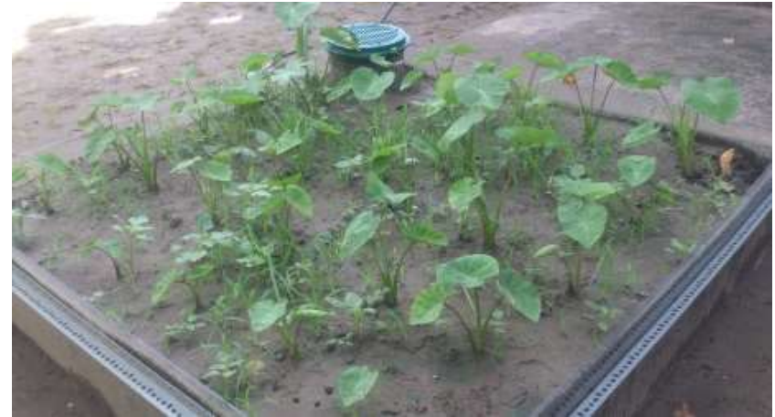
Taro planting underground irrigation 24 days