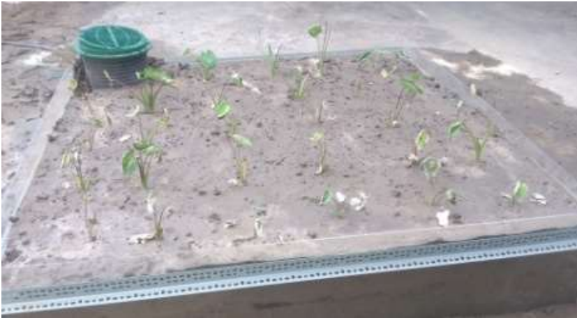
Taro planting underground irrigation 3 days