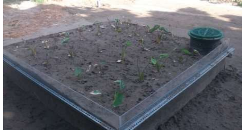
Taro planting underground irrigation 6 days