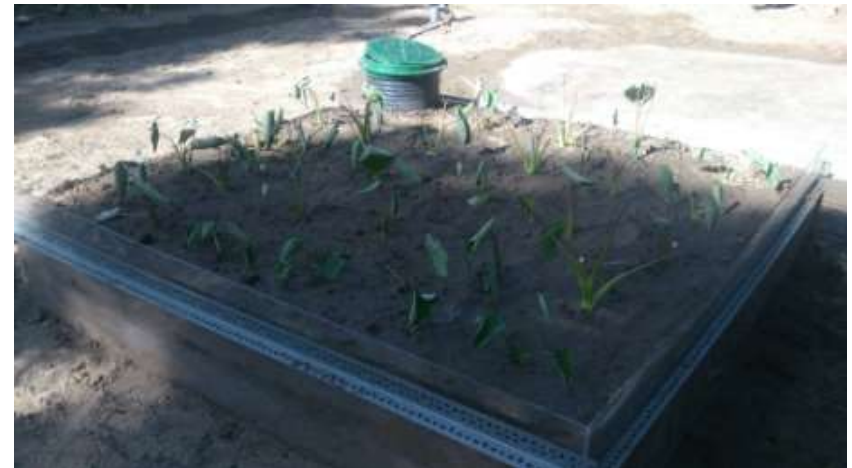
Taro planting and underground irrigation