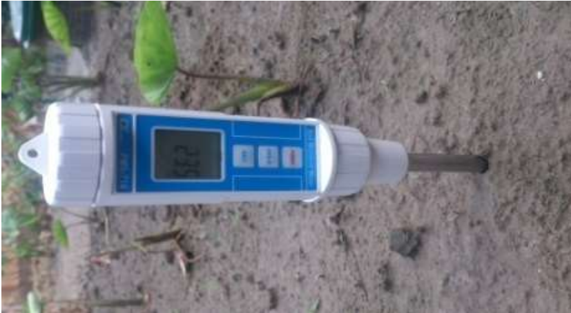
Sub-irrigation watering 1000kg, humidity 23.5%