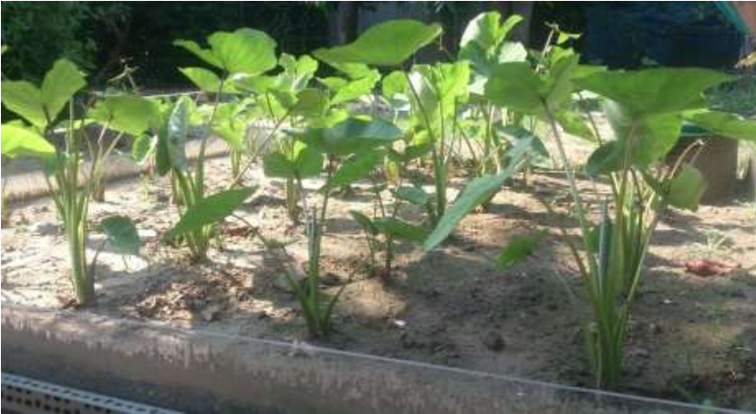
Taro planting underground irrigation 36 days