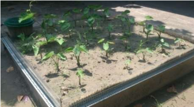
Taro planting underground irrigation 16 days