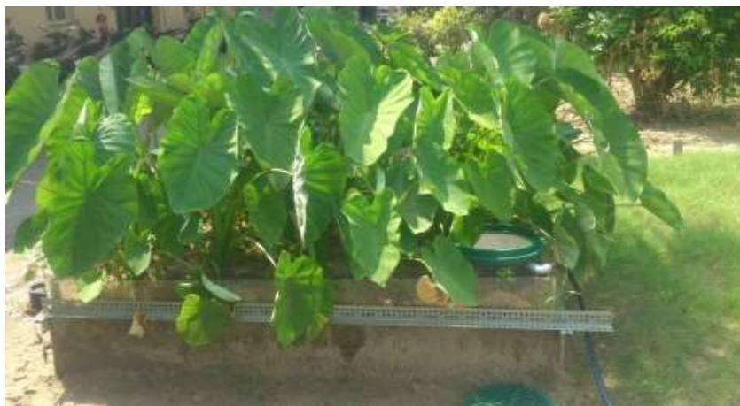
Taro planting underground irrigation 80 days