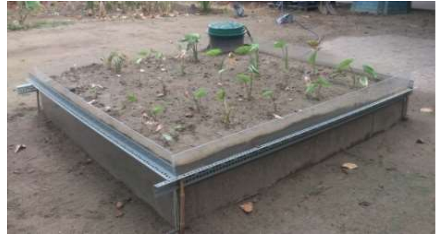
Taro planting underground irrigation 10 days