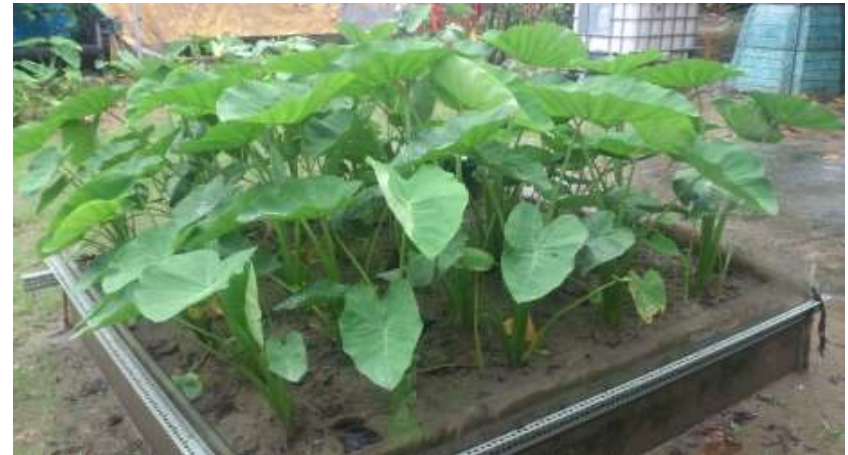
Taro planting underground irrigation 63 days