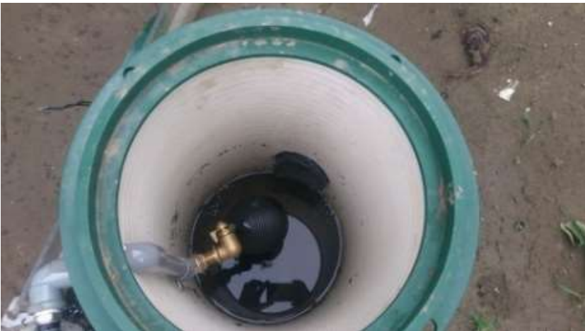
Installation of irrigation well