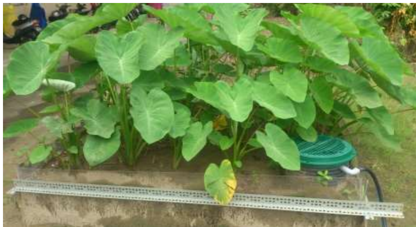
Taro planting underground irrigation 72 days