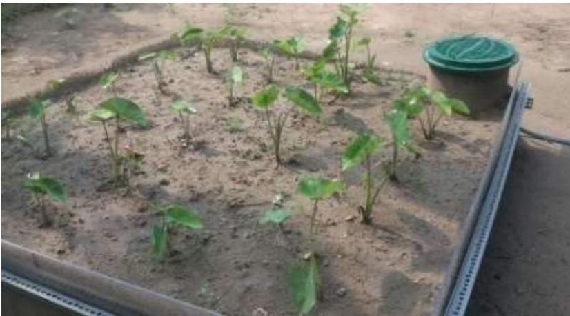
Taro planting underground irrigation 18 days Sub-irrigation watering 500kg