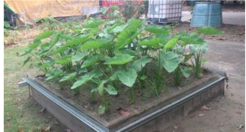
Taro planting underground irrigation 57 days