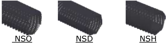
NSO Full permeable type NSD 2/3 permeable type NSH 1/2 permeable type